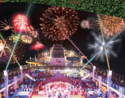
Countdown Party on Christmas Eve with Fireworks at Sea