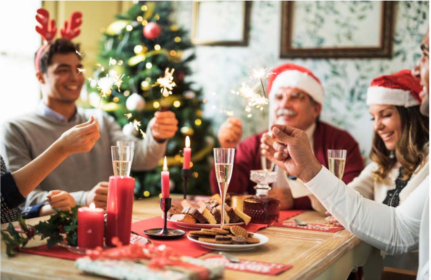
Christmas dinner celebrations