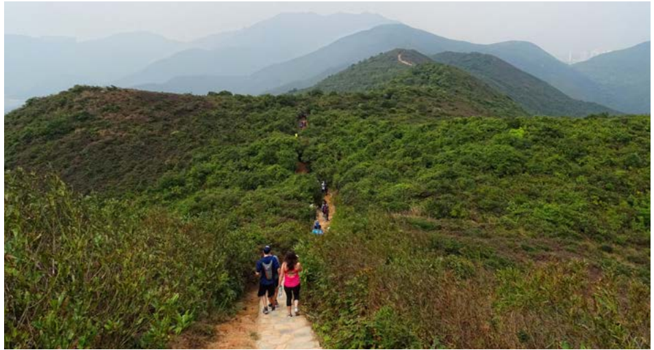
Dragon's Back is perfect for a Boxing Day hike

At its core, Christmas is a time for connecting with family. One of the most popular things to do on Boxing Day in Hong Kong is going for a hike. Make it an annual, earth-friendly tradition to hit Dragon's Back with your kids, reconnect with nature and walk off your holiday meal!