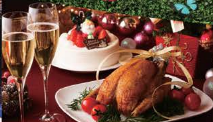
Traditional Christmas Turkey Breast