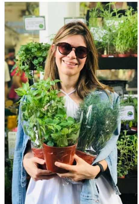
Plants are an everlasting gift

clean-up that comes with it, too. Consider switching to natural and non-toxic cleaning supplies. You can even go down the DIY route and use lemon juice!