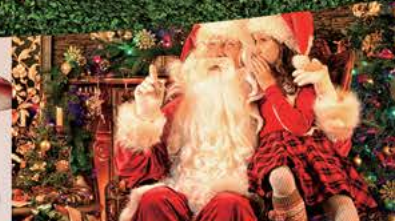
Santa Claus Meet & Greet