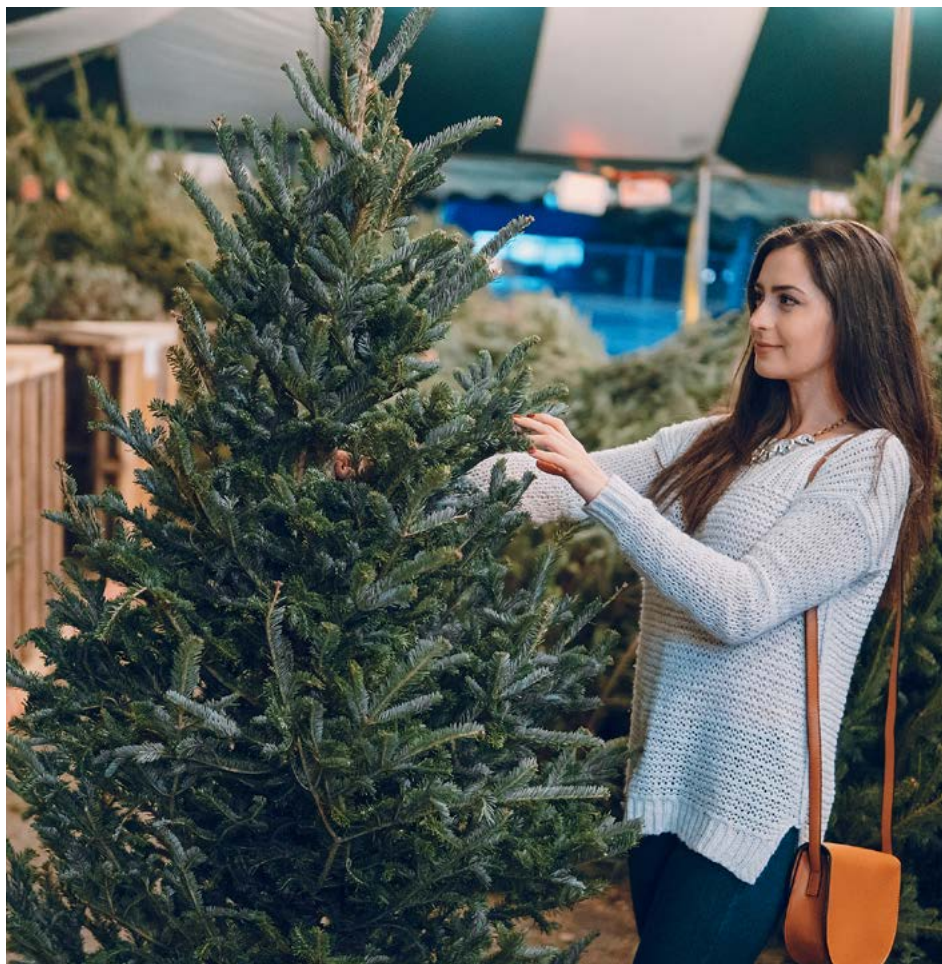
Finding the perfect Christmas tree

Did you know that 40 percent of all battery sales occur during the holiday season? That little robot dog may be fun for a week or two, but keep in mind that it needs plenty of